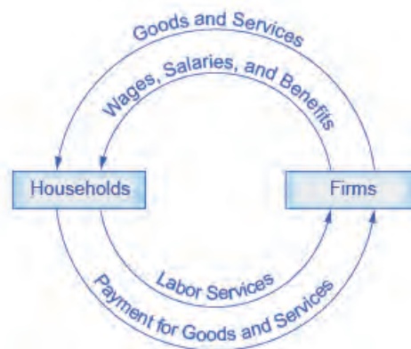
Figure 1.6 The Circular Flow Diagram The circular flow diagram shows how households and firms interact in the goods and services market, and in the labor market. The direction of the arrows shows that in the goods and services market, households receive goods and services and pay firms for them. In the labor market, households provide labor and receive payment from firms through wages, salaries, and benefits.

A good model to start with in economics is the circular flow diagram , which is shown in Figure 1.6 . It pictures the economy as consisting of two groups—households and firms—that interact in two markets: the goods and services market in which firms sell and households buy and the labor market in which households sell labor to business firms or other employees.