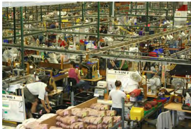
Figure 1.4 Division of Labor Workers on an assembly line are an example of the divisions of labor.

Modern businesses divide tasks as well. Even a relatively simple business like a restaurant divides up the task of serving meals into a range of jobs like top chef, sous chefs, less-skilled kitchen help, servers to wait on the tables, a greeter at the door, janitors to clean up, and a business manager to handle paychecks and bills—not to mention the economic connections a restaurant has with suppliers of food, furniture, kitchen equipment, and the building where it is located. A complex business like a large manufacturing factory, such as the shoe factory shown in Figure 1.4 , or a hospital can have hundreds of job classifications.