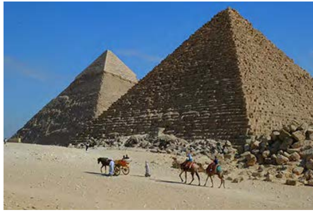
Figure 1.7 A Command Economy Ancient Egypt was an example of a command economy.

Command economies are very different. In a command economy , economic effort is devoted to goals passed down from a ruler or ruling class. Ancient Egypt was a good example: a large part of economic life was devoted to building pyramids, like those shown in Figure 1.7 , for the pharaohs. Medieval manor life is another example: the lord provided the land for growing crops and protection in the event of war. In return, vassals provided labor and soldiers to do the lord's bidding. In the last century, communism emphasized command economies.