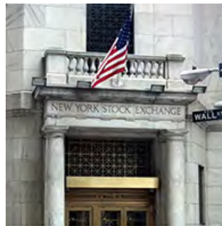
Figure 1.8 A Market Economy Nothing says "market" more than The New York Stock Exchange.

In a command economy, the government decides what goods and services will be produced and what prices will be charged for them. The government decides what methods of production will be used and how much workers will be paid. Many necessities like healthcare and education are provided for free. Currently, Cuba and North Korea have command economies.