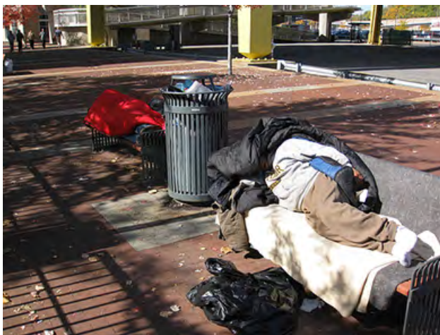
Figure 1.2 Scarcity of Resources Homeless people are a stark reminder that scarcity of resources is real.

If you still do not believe that scarcity is a problem, consider the following: Does everyone need food to eat? Does everyone need a decent place to live? Does everyone have access to healthcare? In every country in the world, there are people who are hungry, homeless (for example, those who call park benches their beds, as shown in Figure 1.2 ), and in need of healthcare, just to focus on a few critical goods and services. Why is this the case? It is because of scarcity. Let's delve into the concept of scarcity a little deeper, because it is crucial to understanding economics.