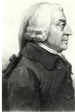
Figure 1.3 Adam Smith Adam Smith introduced the idea of dividing labor into discrete tasks.

any—of those things. It is not because we could not learn. Rather, we do not have to. The reason why is something called the division and specialization of labor , a production innovation first put forth by Adam Smith, Figure 1.3 , in his book, The Wealth of Nations .