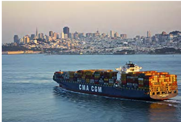
Figure 1.9 Globalization Cargo ships are one mode of transportation for shipping goods in the global economy.

The question of how to organize economic institutions is typically not a black-or-white choice between all market or all government, but instead involves a balancing act over the appropriate combination of market freedom and government rules.