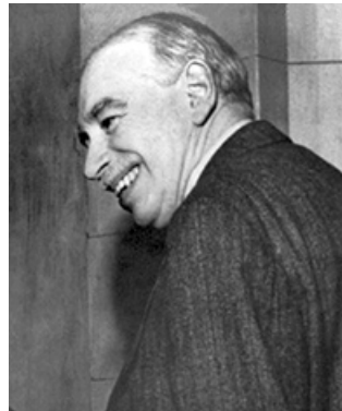
Figure 1.5 John Maynard Keynes One of the most influential economists in modern times was John Maynard Keynes. (Credit: Wikimedia Commons)

John Maynard Keynes (1883–1946), one of the greatest economists of the twentieth century, pointed out that economics is not just a subject area but also a way of thinking. Keynes, shown in Figure 1.5 , famously wrote in the introduction to a fellow economist's book: “[Economics] is a method rather than a doctrine, an apparatus of the mind, a technique of thinking, which helps its possessor to draw correct conclusions.” In other words, economics teaches you how to think, not what to think.